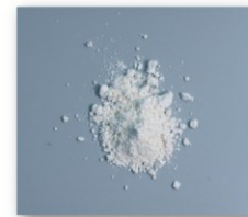
1 S FORM • Raw material • Initial step