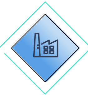
Industrial Business Unit