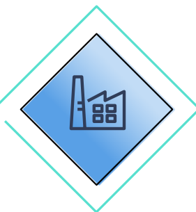
Industrial Business Unit