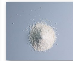
3 F FORM • Regular granules • Final step